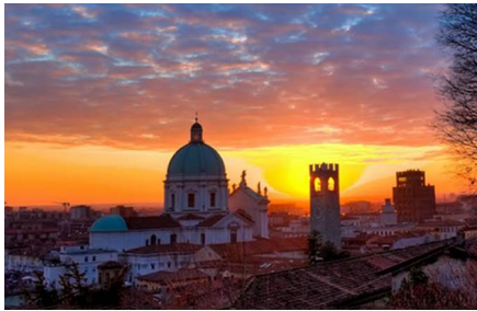
Desenzano del Garda Brescia