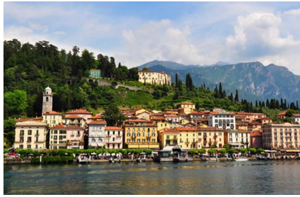
Lago De Garda