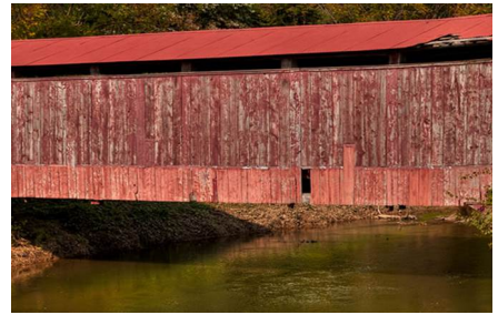
Lancaster - Pa