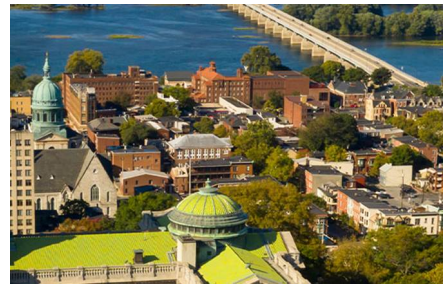
Harrisburg - Pa