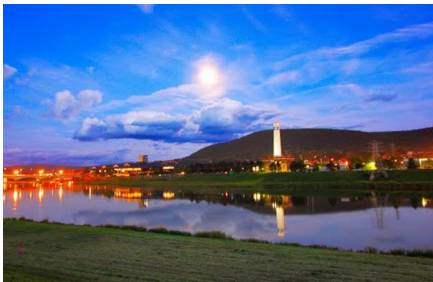
Corning - Ny