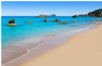
Santa Eulalia del Rio