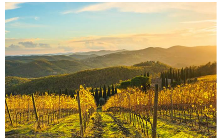
Radda in Chianti