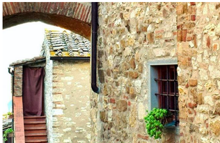
Greve In Chianti