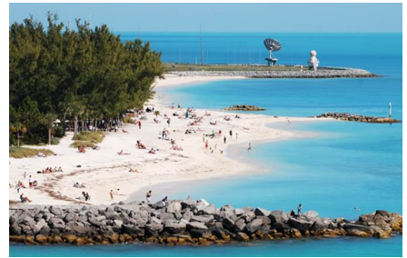
Key West - FL