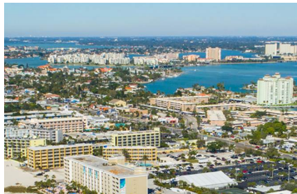
St. Pete Beach