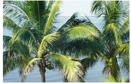
Fort Myers - FL