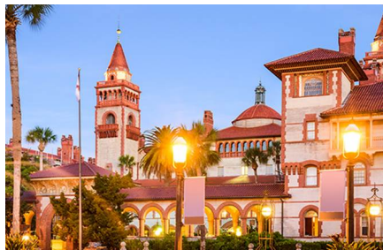
San Agustin - FL