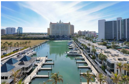
Sarasota - FL