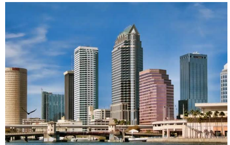
Tampa - Florida