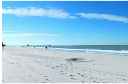
Naples - FL