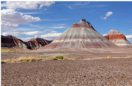
Holbrook - Az