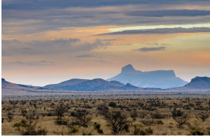
Tucumcari - Nm