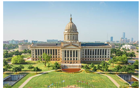
Oklahoma City - Ok