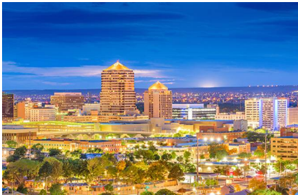
Albuquerque - New Mexico