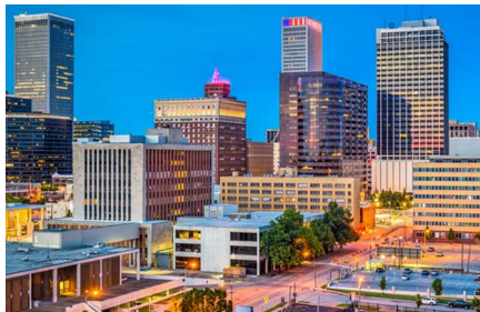
Tulsa - OK