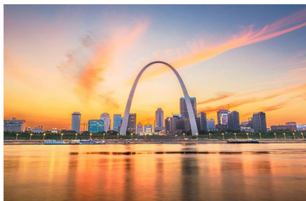
Saint Louis - Missouri