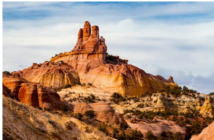
Gallup - Nm