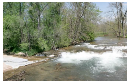
Springfield - Mo