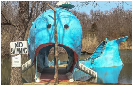
Catoosa - Ok