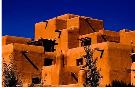
Santa Fe - Nm