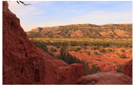
Amarillo - Tx