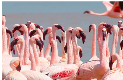
Lake Naivasha National Park