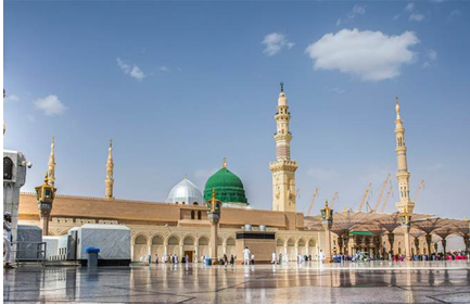
Al Madinah Al Munawwarah