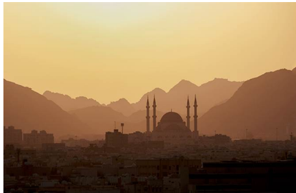
Ha'il Saudi Arabia