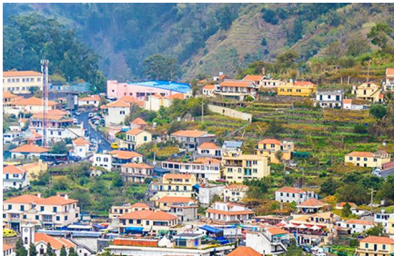
Curral Das Freiras