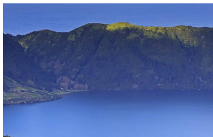
São Miguel Island