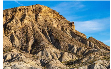
Desierto de Tabernas