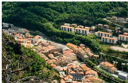
Vall De Nuria