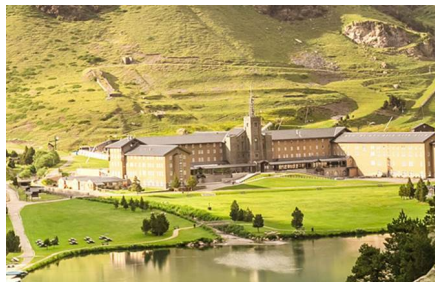
Lles de Cerdanya