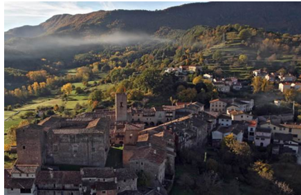
Ribes de Freser