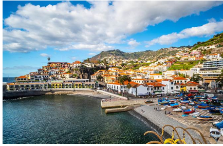
Câmara De Lobos