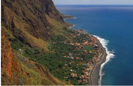
Faja Da Ovelha