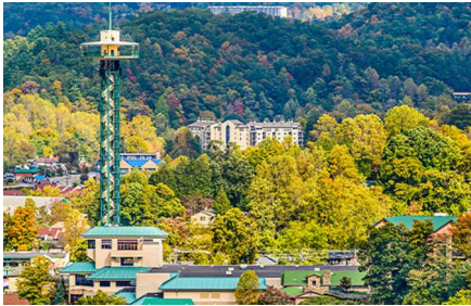
Gatlinburg - Tn