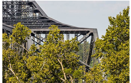
Natchez - Ms