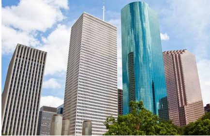
Houston - Texas