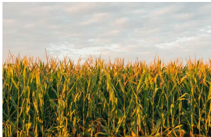
Towanda - Il