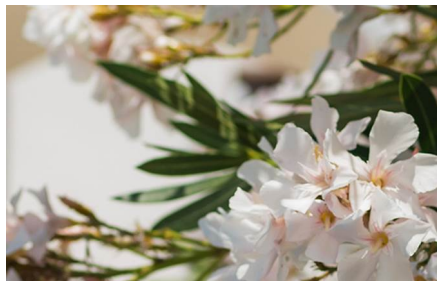
Sant Miquel de Balansat