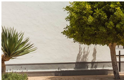
Santa Gertrudis de Fruitera