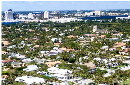
Palm Beach - Fl