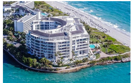
Boca Raton - Fl