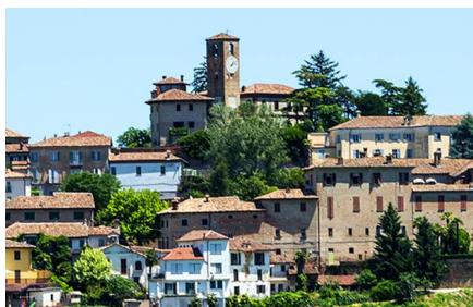
Santa Margherita Ligure