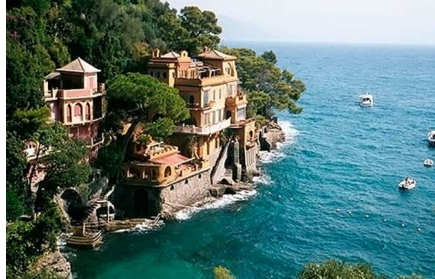
Riomaggiore La Spezia