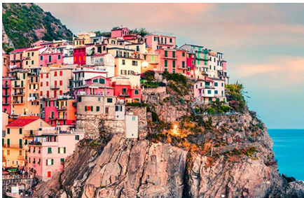
Vernazza La Spezia