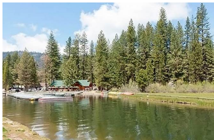
Fresno - Ca