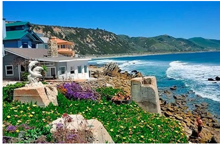
Santa Barbara - Ca