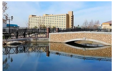
Bakersfield - Ca