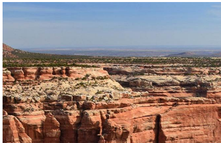
Blanding - Ut