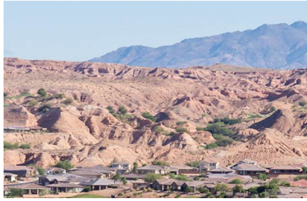
Mesquite - Nv