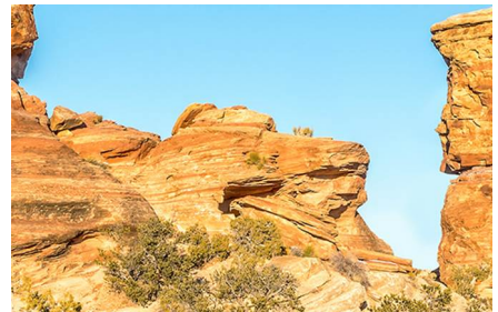
Monticello - Ut