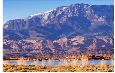
Hurricane - Ut