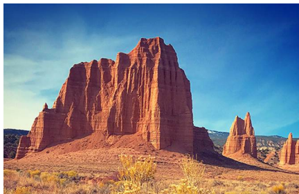
Torrey - Ut