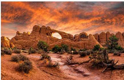
Moab - Ut