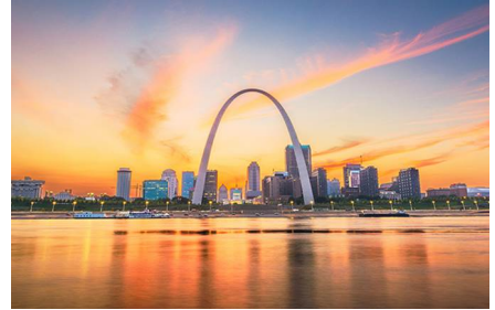
Saint Louis - Missouri