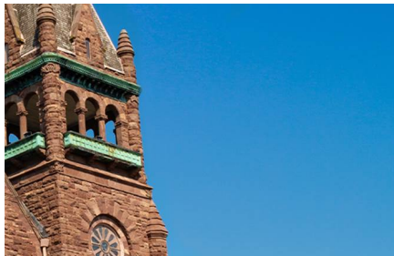
Galesburg - Il