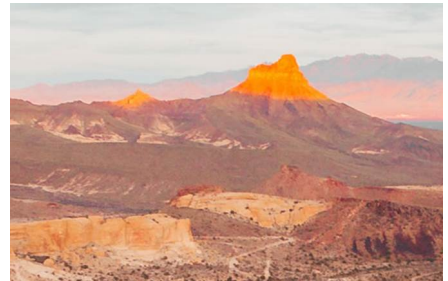
Kingman - Az