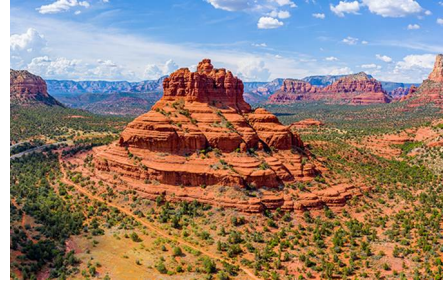
Sedona - Az