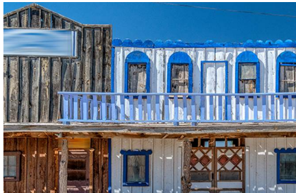
Seligman - Az