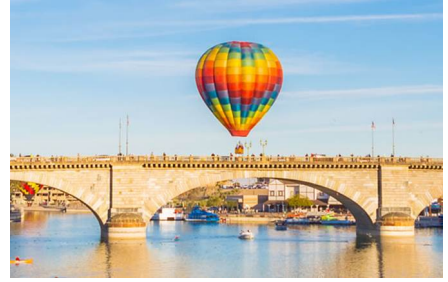
Lake Havasu City - Az