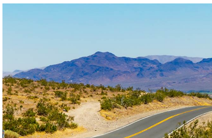
Barstow - Ca