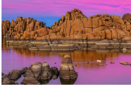
Prescott Valley - Az