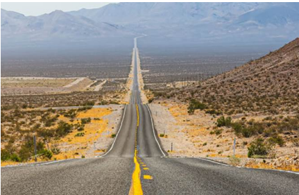
Ash Fork - Az