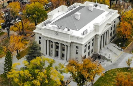
Prescott - Az