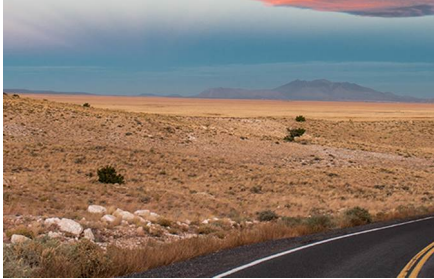
Grand Canyon - Az