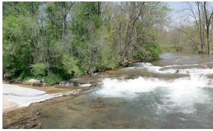
Oklahoma City - Ok