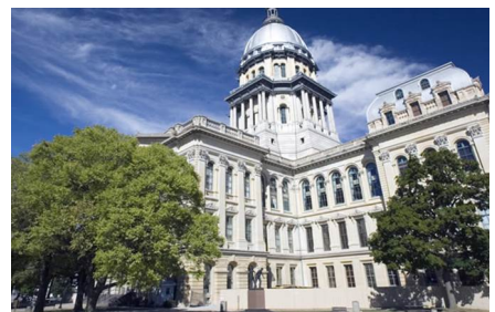
Springfield - Il