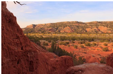
Santa Rosa - Nm