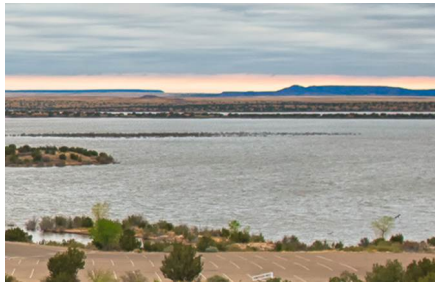
Santa Fe - Nm