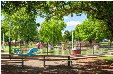
Amarillo - Tx