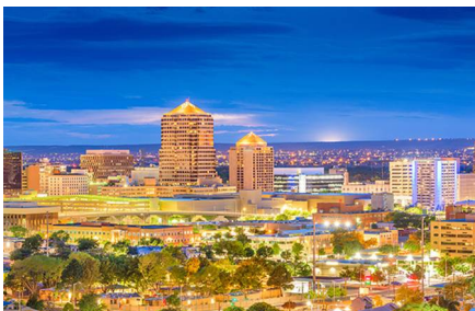
Gallup - Nm