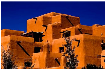
Holbrook - Az