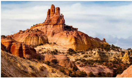
Winslow - Az