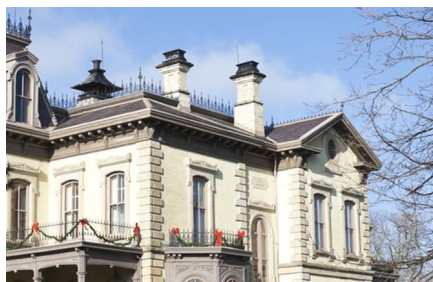
Bloomington - Il