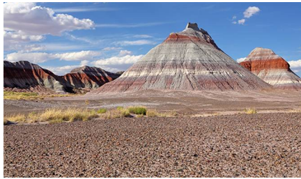
Flagstaff - Az