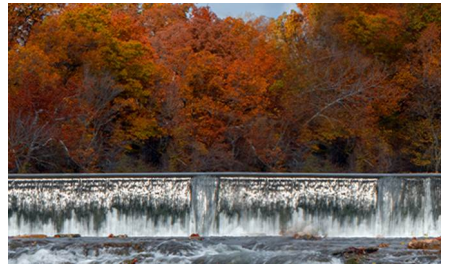
El Reno - Ok