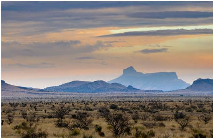
Albuquerque - New Mexico