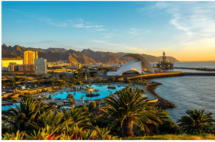
Santa Cruz De Tenerife