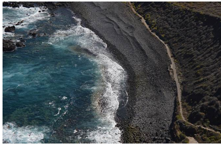
Buenvista del Norte