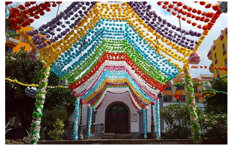
Icod De Los Vinos