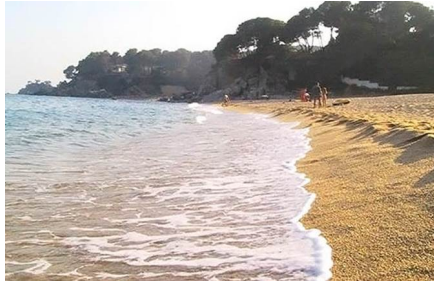
Sant Feliu de Guixols