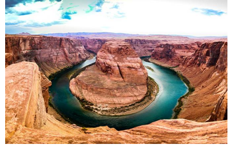
Grand Canyon - Az