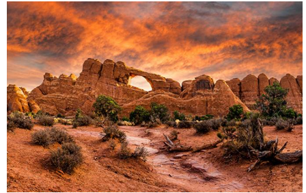
Moab - Ut