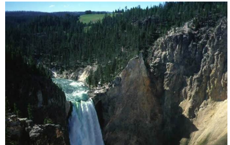
Yellowstone - Wy