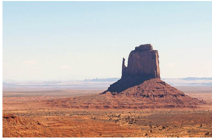
Monument Valley - Ut/Az