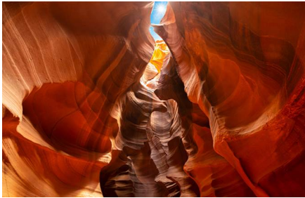
Page - Az