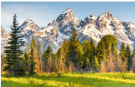
Grand Teton - Wy