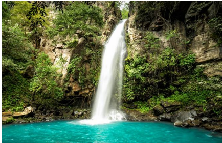
Rincón de la Vieja