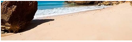
Praia da Rocha