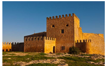
Argamasilla de Alba