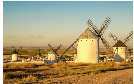
Campo de Criptana