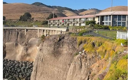
San Luis Obispo - Ca