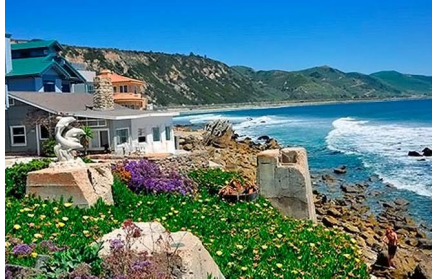
Santa Barbara - Ca