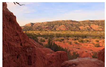
Amarillo - Tx