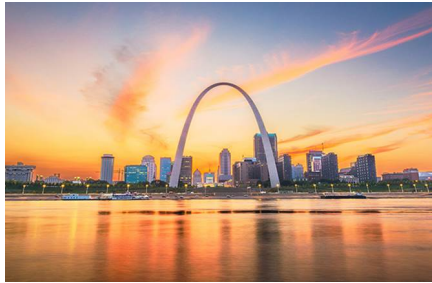
Saint Louis - Missouri