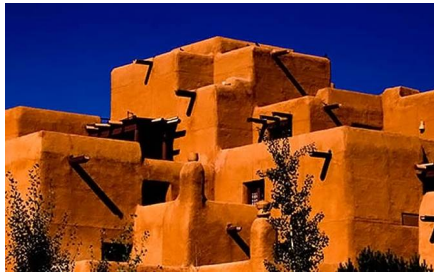
Gallup - Nm