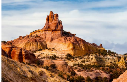
Grand Canyon - Az