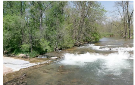
Springfield - Mo