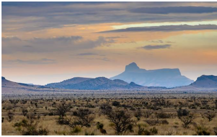
Albuquerque - New Mexico