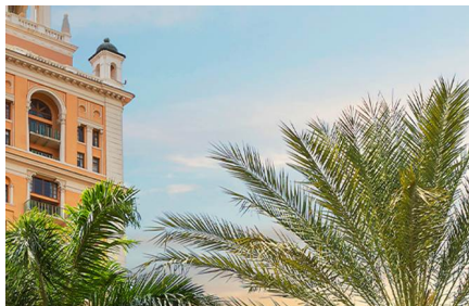
Coral Gables - FL