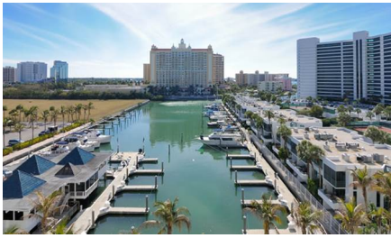
Crystal River - FL