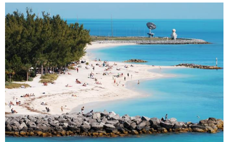
Key West - FL