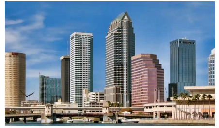
Daytona Beach - Florida