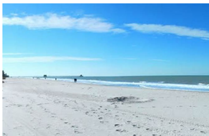
Naples - FL