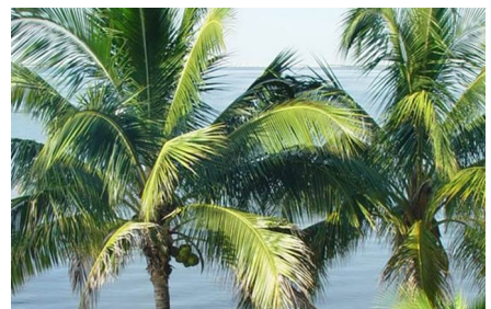
Fort Myers - FL