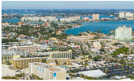
San Agustín - FL