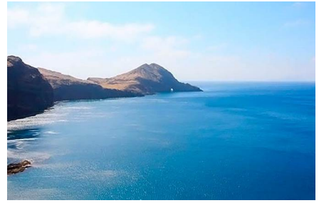
Ponta Do Sol