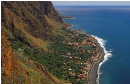
Faja Da Ovelha