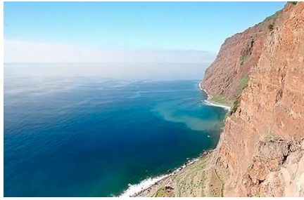
Câmara De Lobos